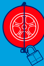
Adjustable Gate Valve Lockout

SOURCES: Safety+Health Magazine, 2017; National Safety Council, 2017; Convergence Training, 2017; National Marker Company, 2018.