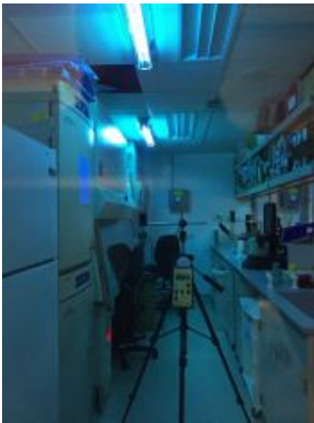
Ceiling UV light used for air and surface disinfection

Consult the manufacturer's manuals for specific information about the potential exposure level and frequency of radiation, as well as the suggested operating protocols.