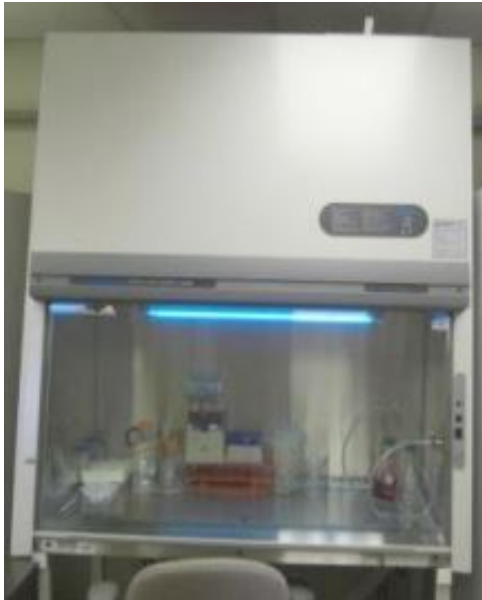
Example of biosafety cabinet with germicidal lamp

The effects on skin are of two types: acute and chronic. Acute effects appear within a few hours of exposure, while chronic effects are long-lasting and cumulative and may not appear for years. An acute effect of UVR is redness of the skin called erythema (similar to sunburn). Chronic effects include accelerated skin aging and skin cancer.