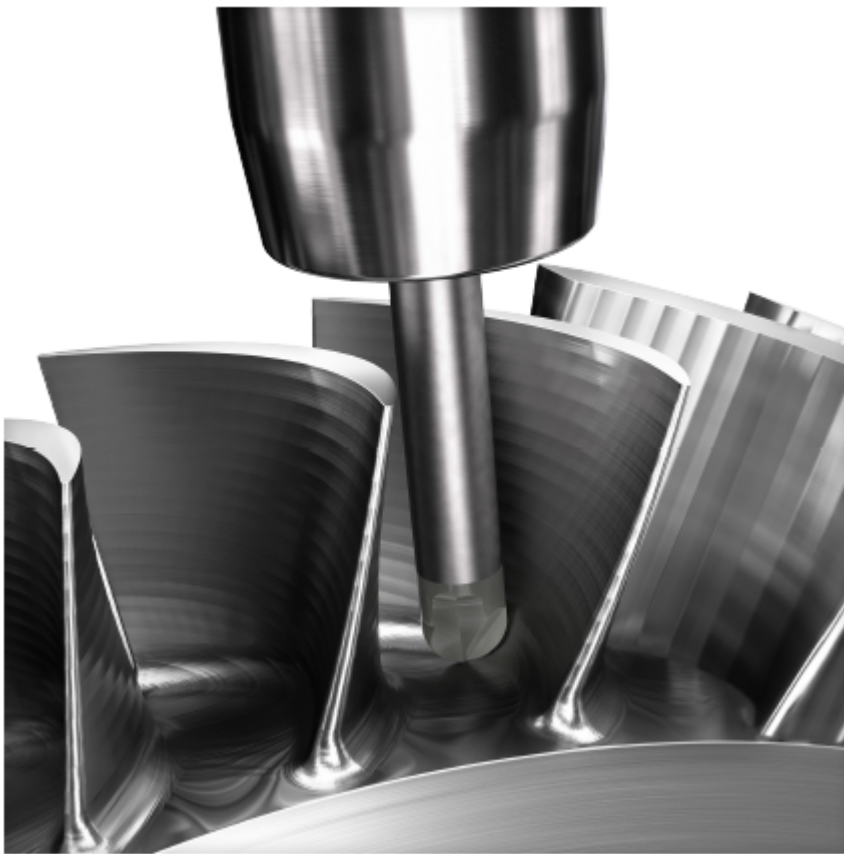
CM Plura Ceramic Blisk

By replacing the existing (competitor) solid-carbide end mill with the ceramic CoroMill Plura , the customer was able to increase many of the cutting parameters significantly. For instance, cutting speed was increased from 25 to 500 m/min (82 to 1640 ft/min), while feed speed could be elevated from 92.82 to 2387.34 mm/min (3.71 to 95.49 in/min). In addition, axial depth of cut was doubled, from 0.25 to 0.5 mm (0.01 to 0.02 in). The same 12 mm (0.472 in) radial depth of cut was deployed, while feed per tooth was in fact reduced slightly from 0.035 to 0.03 mm/z (0.0014 to 0.0012 in/z).