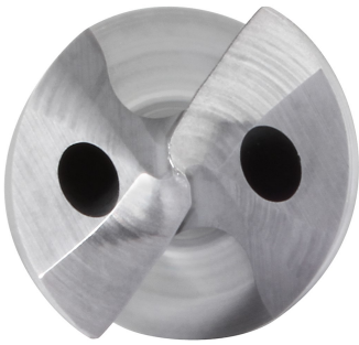
HPX drill point

flutes. Couple that with a proprietary multilayer AlTiN coating designed specifically for steel—KCP15B—and the HPX drill sets a new standard for tool life in high-volume ISO-P drilling.