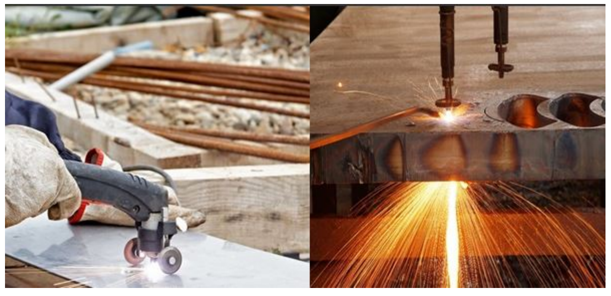
Manual Plasma Cutting vs. Mechanized Plasma Cutting

Across each industry, both manual and mechanized plasma cutters are used. The equipment utilized all depends on what is needing to be cut and the mobility required. For example, construction work is performed remotely, not in a fixed building, which means you can't take mechanized cutters entirely with you out onto the job site.