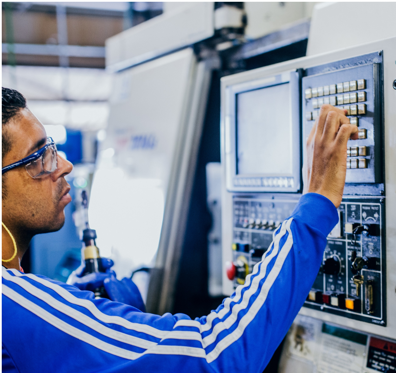
ZF's machine operator prepares for the machining of automotive pipes using a Doosan MV3016LS vertical machining center.

ZF was originally using a carbide tap M14 for the application. However, the company was experiencing great difficulty with irregular chip formation, bird nesting, and elongated chips that cause chipping of the fillets. Furthermore, with cutting chips clogged up in the bottom of the hole unable to be evacuated, issues such as chipping and tool breakage were also a great headache for the company. OSG Sulamericana was an existing tooling supplier for ZF in other applications. When the opportunity arose to compete within this process, OSG entered and won the order with superior results.