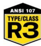
Performance Class 3 Type R & Type P