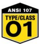
Performance Class 1 Type O Only