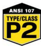
Performance Class 2 Type R & Type P