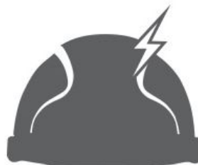
Class G (General) protection means the hard hat is proof-tested at 2,200 volts.