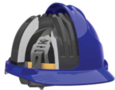
Type II (Top and Lateral Impact) Offers Side (Lateral) Impact Protection which reduces the force of impact resulting from a blow which may be received off center as well as to the top of the head