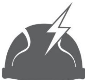
Class E (Electrical) protection means the hard hat is proof-tested at 20,000 volts.