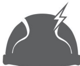
Class G (General) protection means the hard hat is proof-tested at 2,200 volts.