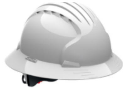
Type I (Top Impact) designed to reduce the force of impact to the top of the head