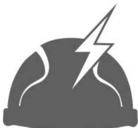
Class E (Electrical) protection means the hard hat is proof-tested at 20,000 volts.