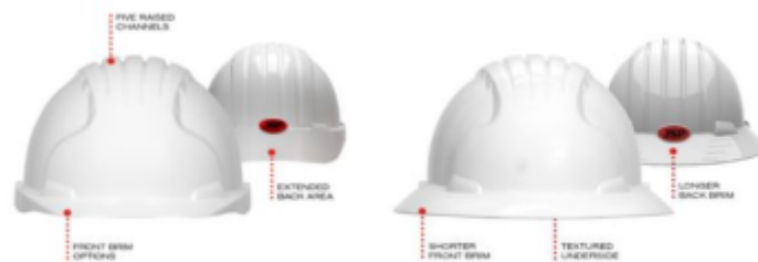
Cap style (left) versus Full Brim style

There are a number of factors that lead to choosing the proper hard hat for a working environment, including style, suspension, the ANSI/ISEA Z89.1-2014 standard risk assessment and electrical class.