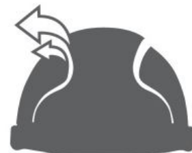
Class C (Conductive) protection means the hard hat is not intended for use near electrical hazards, but is vented for breathability.

If the wearer is not using electrically insulated gloves or any other electrical protective clothing, it is likely that the Class E is not a necessary requirement to meet. In such cases, the benefits of a Class C Vented hard hat, such as comfort and reduced fatigue from heat exposure, will help improve output from the worker. Our Class C hard hats still have no metal components .