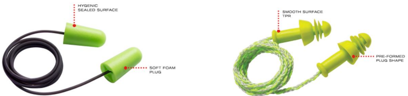
Single use (left) vs. multiple use ear plugs

Ear plugs are a popular choice because they are seen as the most economical solution, and they can easily be worn with other PPE.