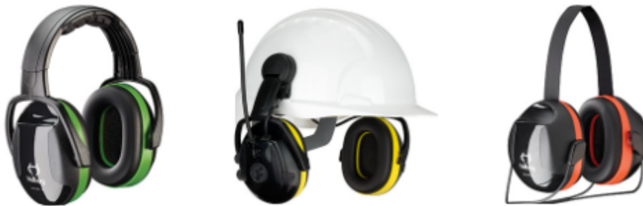
(Left to right) Headband, Cap Mounted and Neckband

When combining hearing protection with other protective equipment, it is important that the hearing protection attenuation is not impaired due to the combination. For example, the temples of safety eyewear should be of a low-profile type to minimize the reduction of performance. If you are uncertain if your other equipment will affect the attenuation, it may be wise to choose an ear muff with a slightly higher protection level than what the analyze method is stating.