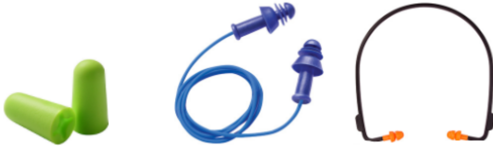
(L-R) Uncorded, Corded and Banded

These features help tailor a product to be safer and more convenient in a specific working environment, whether that means fitting in a dispenser or keeping track of plugs after removing them from the ear.