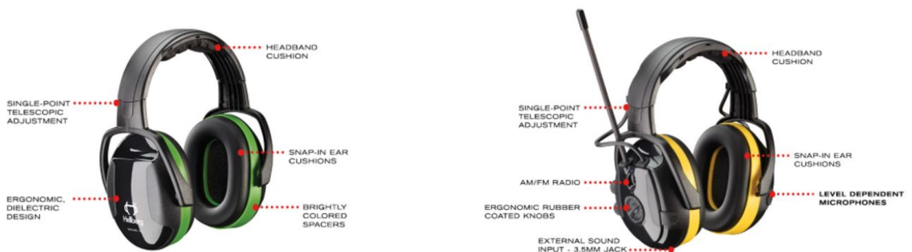
Passive (left) vs. electronic ear muffs

All hearing protection methods have capability to reduce noise. Devices with only this function are called passive hearing protectors. Electronic styles integrate advanced electronics with the ear muffs to suit multiple work environments.