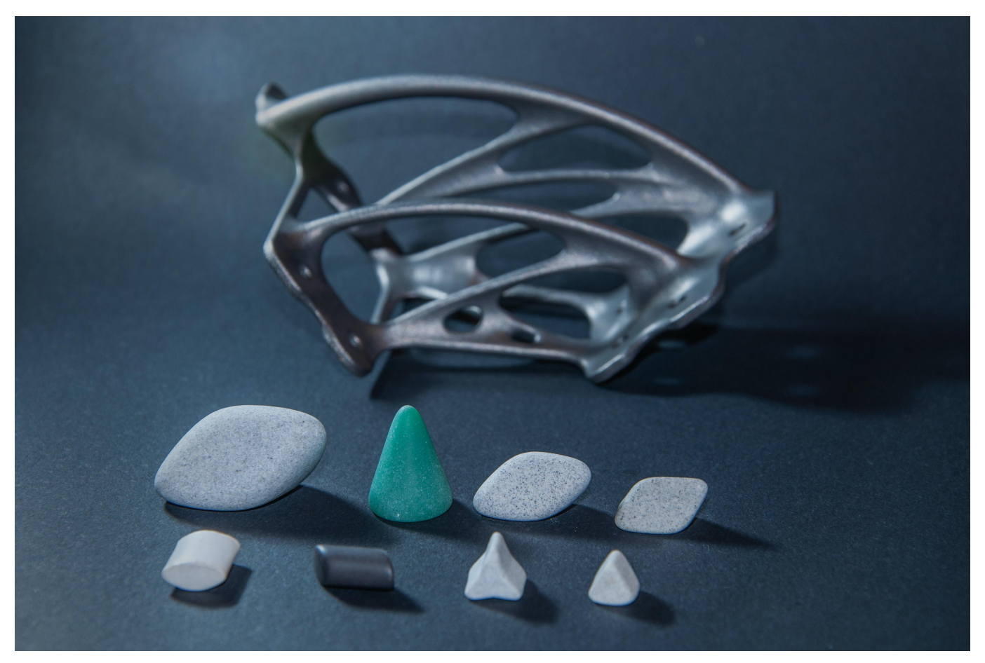
When using vibratory finishing and tumbling processes, a variety of media shapes and sizes are often necessary to reach part features and to achieve the desired surface qualities.

Kerschbaum goes on to list the various steps needed before these and other post-processing operations can be performed.