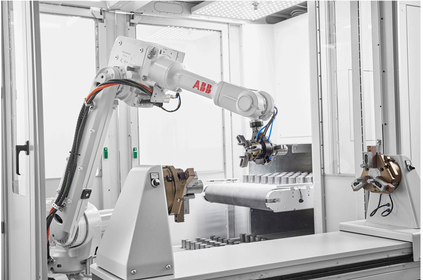
ABB's FlexLoader M offers a flexible and expandable solution for a wide variety of machine tending applications including lathes, mills, CNC and machining centers.