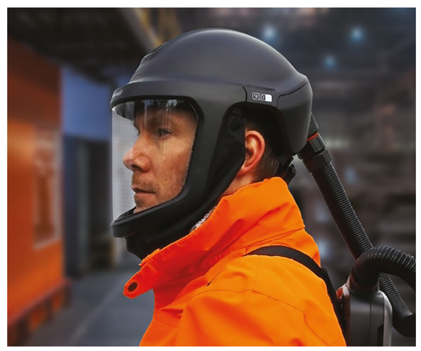
The North Primair 900 Series Headgear is designed for easy donning and doffing.

That behavior presents a significant risk of severe injury or even death to workers and the possibility of costly fines for employers. The U.S. Occupational Safety and Health Administration issued more than 2,000 citations for violations of Standard 1910.134 , the rule governing respirators, in the year through September 2021. The agency also imposed $4.46 million in penalties, with the largest hitting the healthcare and manufacturing industries. They were charged $2.19 million and $1.3 million, respectively.