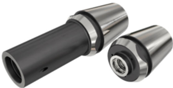
ER collet to MM connection

One of the main benefits of the Multi-Master system is the versatility to build a tool assembly to various lengths using a wide variety of shanks made from steel, carbide and heavy metal. There's also integral tool holder and ER collet options that are ideal for increasing rigidity and reducing tool gage lengths when needing to work in tight areas. When extended length reach is needed, combining high feed indexable tooling with heavy metal shanks is an excellent combination for reducing vibrations and optimizing rough milling applications.