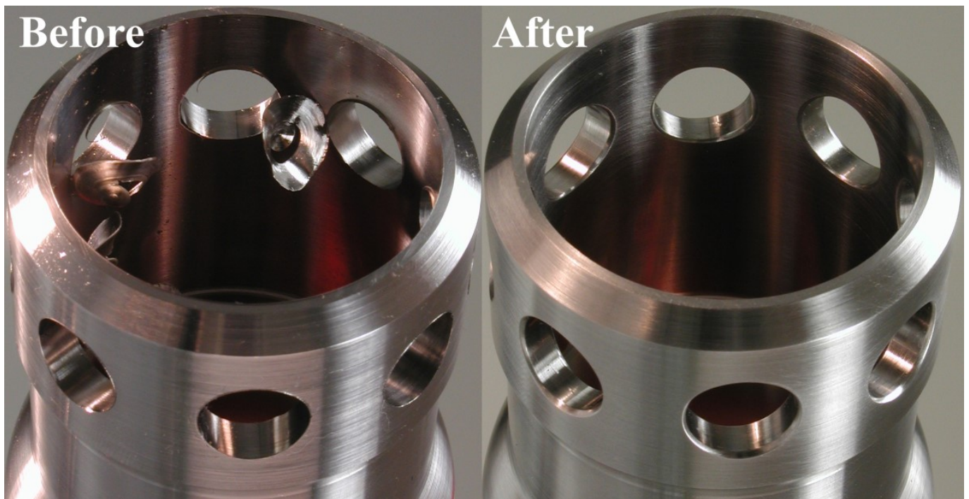
Through hole example before and after

Despite the fact that these are abrasive tools, Garaczi says that even though “abrasives” are often all lumped into the same category, a distinction must be made between abrasives used for aggressive material removal and abrasive finishing tools. Finishing tools release little to no abrasive grit during use, and the amount generated is comparable to the metal chips, grinding dust and tool abrasion created during the machining process itself.