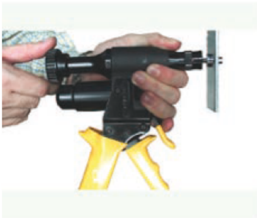
On the left: tool manufactured by Dubuis