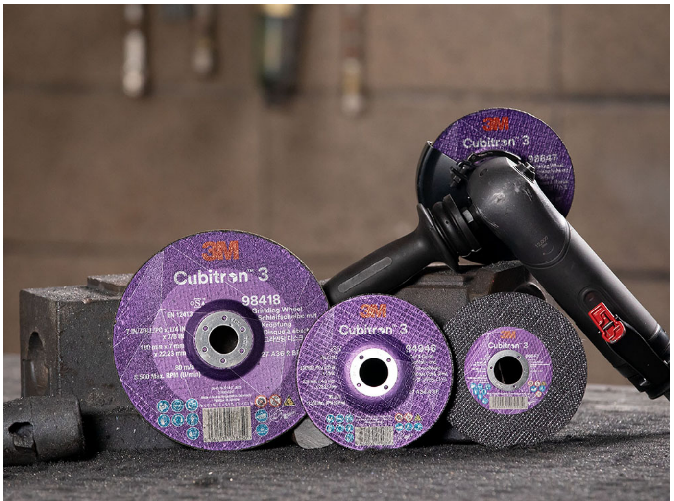
Cubitron 3 fiber discs reportedly deliver an initial cut rate up to 53 percent faster than the Cubitron II.

Both feature sharp pyramid-shaped peaks that “easily slice” through stainless steel, aluminum and heat-sensitive alloys, but the Cubitron 3 goes a step further with a reengineered grain design and proprietary resin binding for increased life.