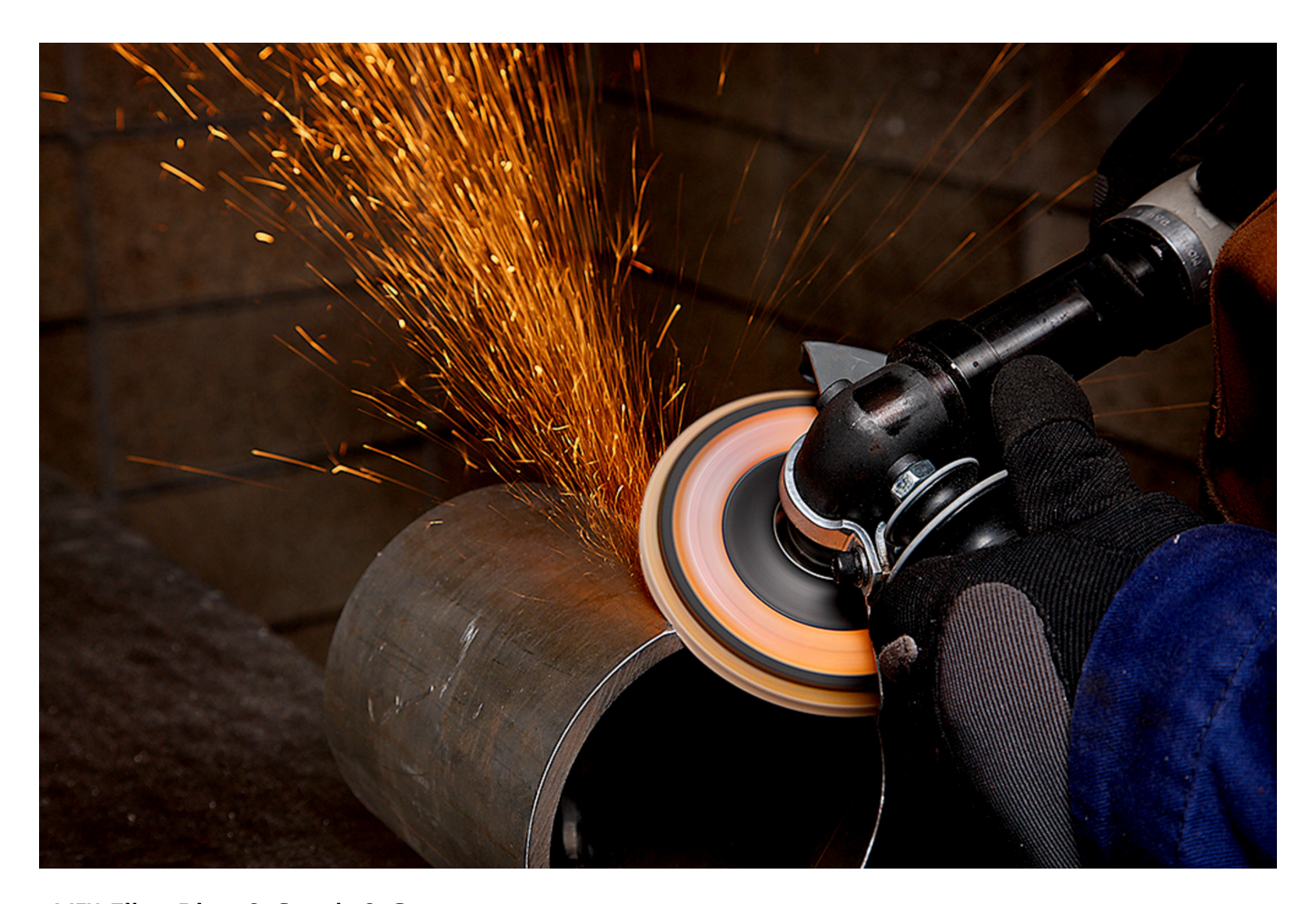
3M™ Fibre Disc 782C and 787C

The fastest way to achieve a bevel. 3M Fibre Discs 782C and 787C represent a new class of high-performance right angle abrasives – powered by the legendary speed and long life of 3M Precision-Shaped Grain. They are an ideal choice for applications like weld removal, beveling, edge chamfering and more – offering a faster cut and longer life than alumina zirconia (AZ) and conventional ceramic abrasives. 3M<sup>TM</sup> Fibre Disc 782C is an ideal choice for carbon steel. 3M<sup>TM</sup> Fibre Disc 787C is optimized for stainless steel and non-ferrous metals like aluminum.