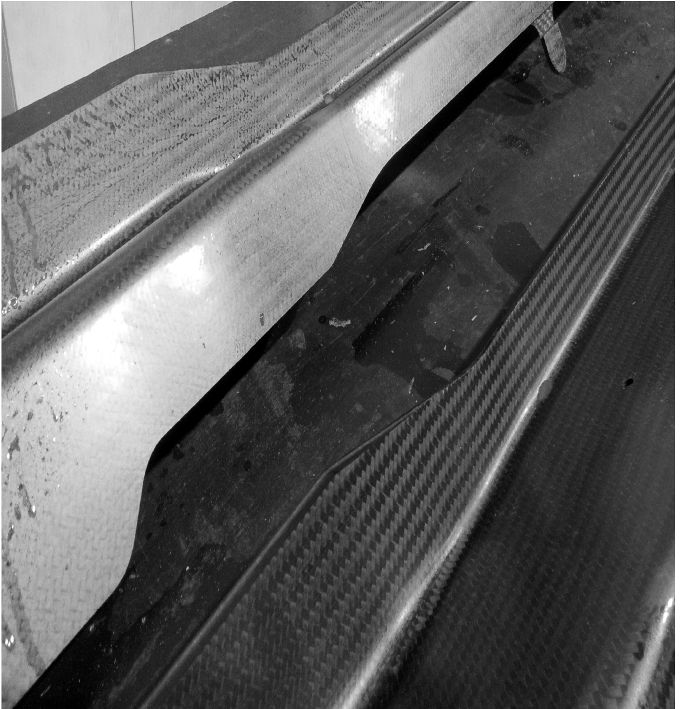
Z-shape spars that TAI has been manufacturing since 2008.

The composite wing spar that TAI produces measure 5.5m in length and 0.5m in width. Four of the Z-shaped spars make up one set of ailerons. A total of 64 sets of ailerons are manufactured per year. A profile tolerance of \pm 0.5\text{mm} around the entire edge of the part is required. The Z spars are produced in a sophisticated five-axis FOG precision milling machine.