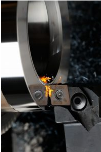
Seco Tools' Secomax CBN complete HPT grade chain.

"Today, through advanced coating technology, we can control the orientation and bring a harder and tougher structure to the point of cut. These textured coatings are 15% tougher than the old version and also 10% harder. That again means as much as 20% more cutting speed and as much as 20–30% longer tool life," said Eller.