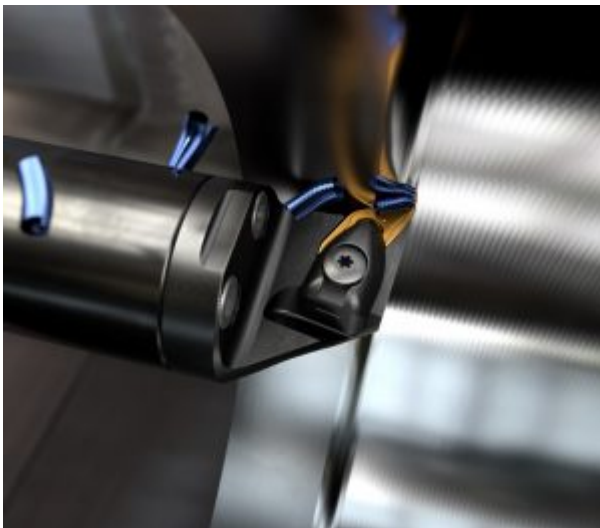
Sandvik Coromant's PrimeTurning concept.

PrimeTurning then can be regarded not just as a new tool, but as a totally different way of performing turning operations more efficiently and more productively, according to the company.