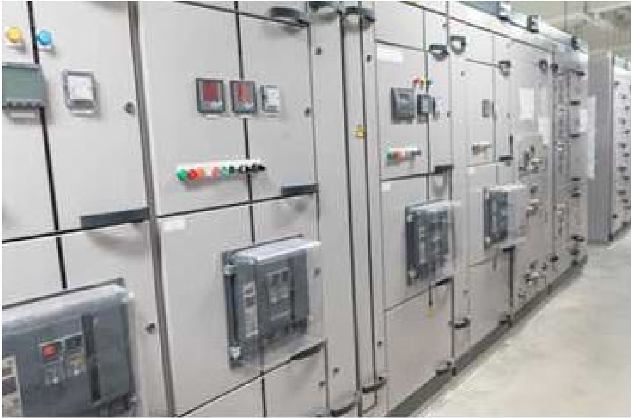
MOTOR CONTROL CENTERS