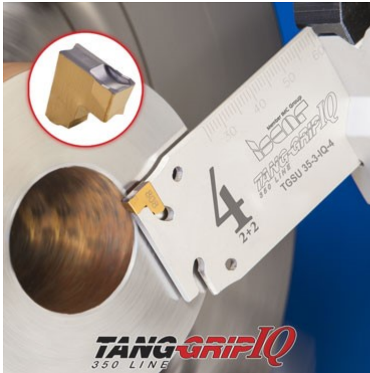
Fig. 1. Iscar's TANG-GRIP system is an extremely rigid clamping arrangement that ensures the highest levels of stability along with excellent chip control in most materials.