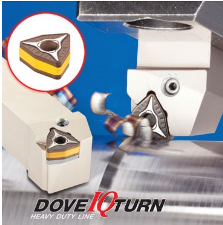
Fig. 2. High-feed turning with DOVE IQ TURN inserts is ideal for rough turning operations.